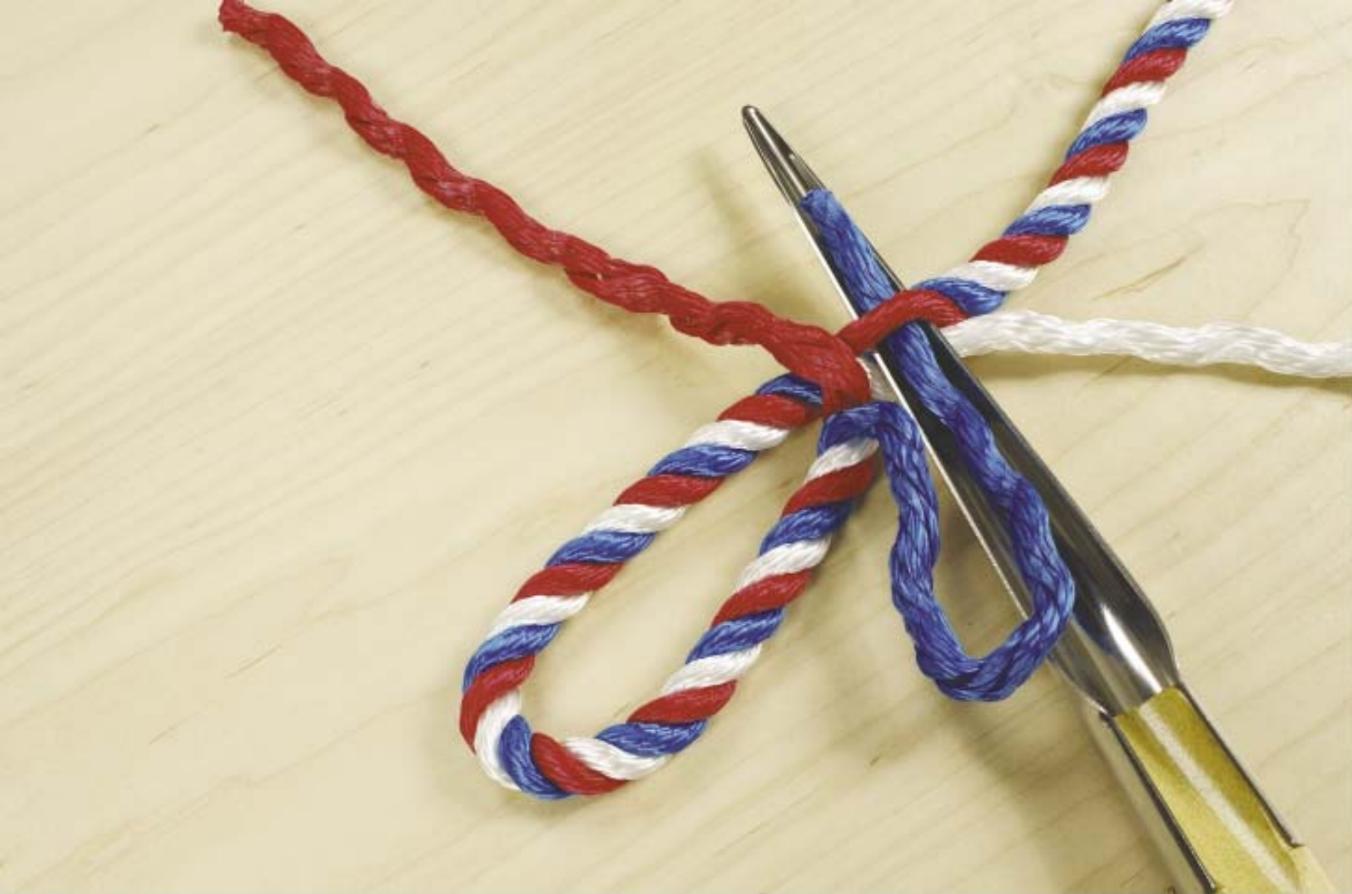
Photo showing the second strand being pushed through.