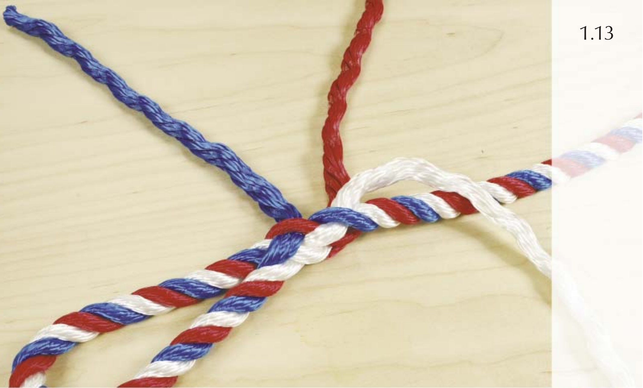
Photo showing the first strand having been pulled through for the second time.