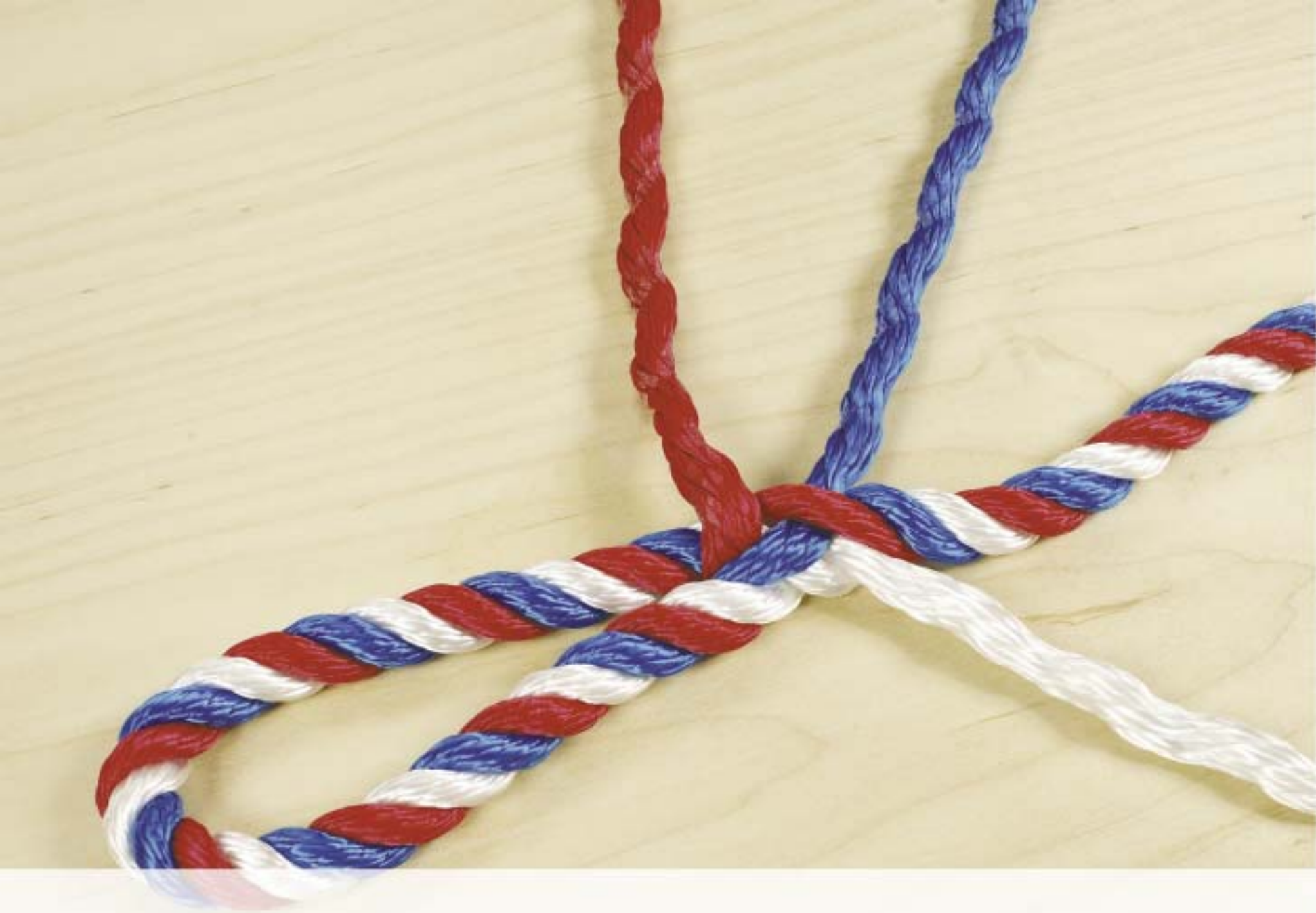
Photo showing the second strand pulled through.