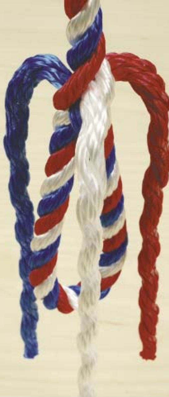
Photo showing the splice after the first round of tucks. The three strands should be level after each round.