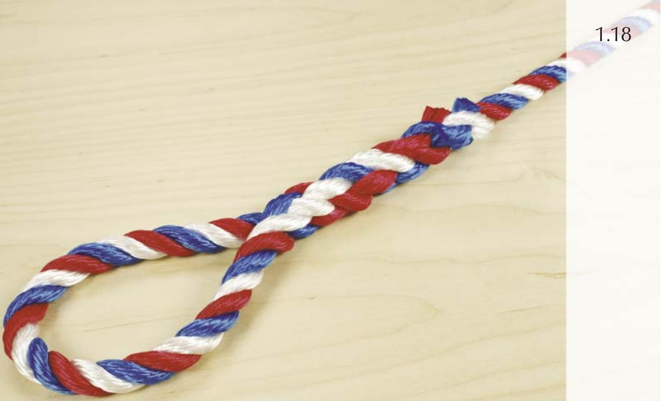
The finished splice.