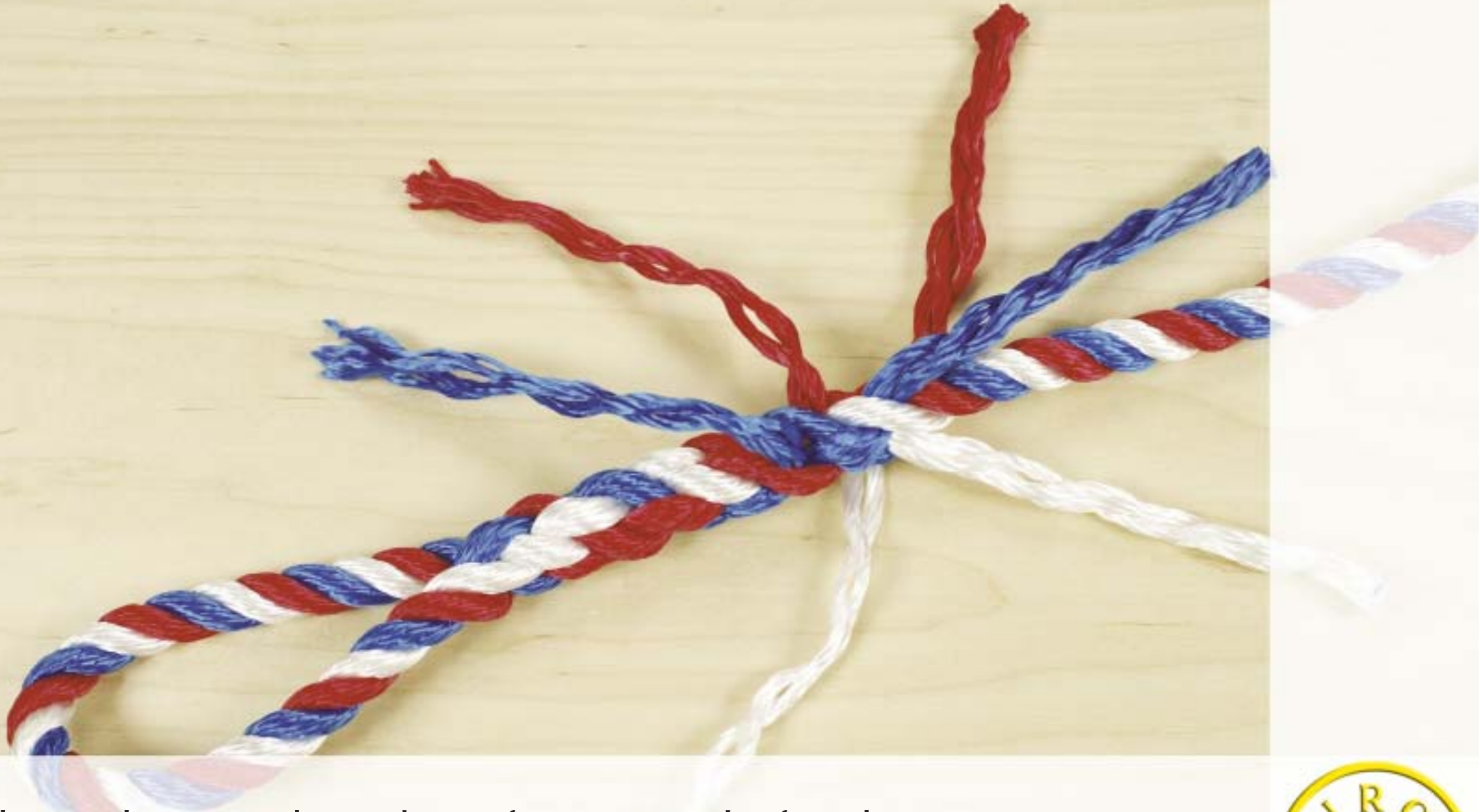
Photo showing the splice after a round of tucks using the reduced size strands.